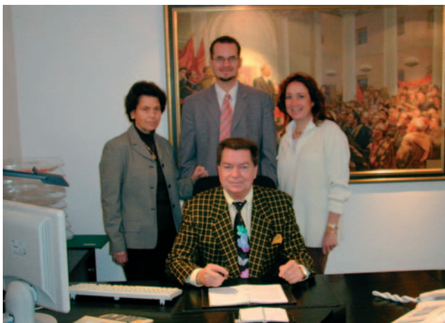
ROMEX® AG's management team keeps the company on track for growth.

ducts are being produced near to Euskirchen since 1991. More and more products registered under the name ROMEX® were added. With the foundation of foreign subsidiaries in Poland, Czech Republic, Russia, Romania and Bulgaria, the company, since 1999 a stock holding company, increased its activities in Eastern Europe considerably. Today there are 30 employees at the head office in Euskirchen and a further 120 employees working in the five subsidiaries.