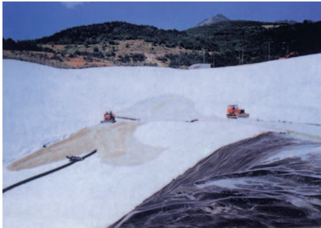
Competent also in sealing technologies: ROMEX® AG supplied the complete sealing system for the Gotze Deltchev Landfill in Bulgaria.